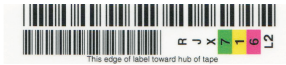
HPE LTO-1 or LTO-2 dual bar code label