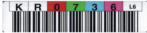
HPE LTO-6 single bar code label